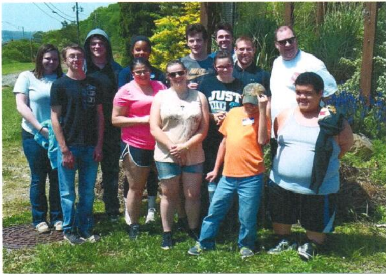
Following the trade skill instruction, the 11 IL youth and staff enjoyed an afternoon of mini golf at Frontier Falls in Rochester, PA.

Each Youth Advisory Board across the state is competing to have the most items donated by July 13 th , 2017. As part of the Southwest Regional YAB, our independent living program is taking part in the competition. If you have canned goods, other non-perishable food items, and/or hygiene items you can also give them to your IL worker or drop them off at the Butler IL office. The items will be donated to an organization of the Southwest Regional YAB's choosing. Keep collecting!